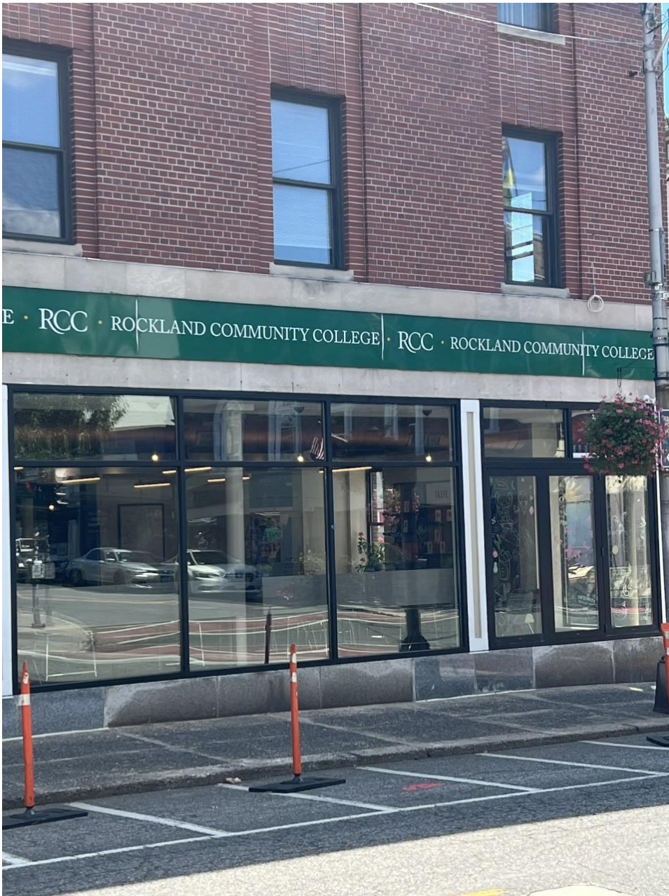
Nyack Satellite Campus N. Broadway Nyack, NY 10960